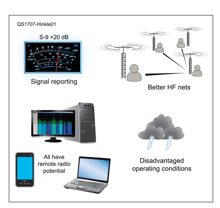
Figure 1 — Common uses of remote radio.

The internet connects global remote radios together.