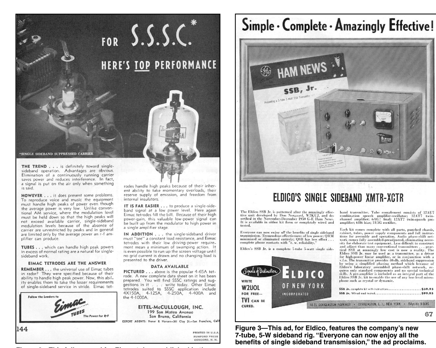
Figure 2—This full-page ad for Eimac tubes, published in the July 1948 issue of QST, touts the advantages of SSSC.

editorial introduction to his article noted that by "action of the 1933 A.R.R.L. Board Meeting, the technical staff of QST was instructed to investigate the feasibility of single-side-band carrierless 'phone transmission on amateur frequencies." Some sideband experimentation was carried out in the mid-1930s by a small group of hams,1 but it was hampered by technological limitations of equipment at the time. World War II changed all of that, making enormous advances in radio technology. After hostilities ended and Amateur Radio resumed, there was no longer any technological reason for sideband to stay on the sidelines and a very pressing need for a communications mode that would occupy less bandwidth than did AM and so free up space on ham frequencies. Sideband was exactly what the doctor ordered, and a concerted push by the ARRL would effectively spread the word,