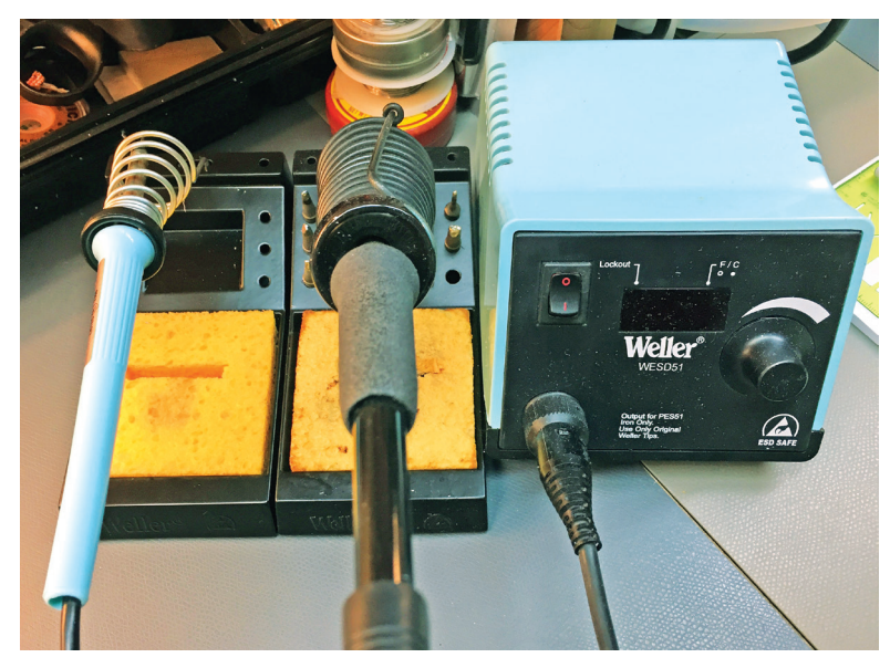
Figure 2 — The Weller model WM120 Mini Iron is on the left, and the model WES51 soldering station is on the right.

Afterwards, I return to the first pin and re-solder the connection.