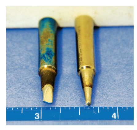
Figure 3 — The Mini Iron pencil tip (right) is preferred over a flat, wide soldering station tip (left).

Keeping the soldering iron tip clean and properly tinned goes a long way to making good solder connections. With the number of resistors in this project and their proximity to one