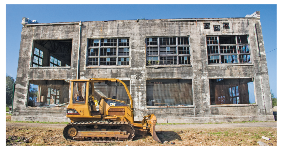
The powerhouse building during preservation efforts in 2007.

The station's powerhouse and operating building (upper photo), the largest in the world at the time of construction in 1913.