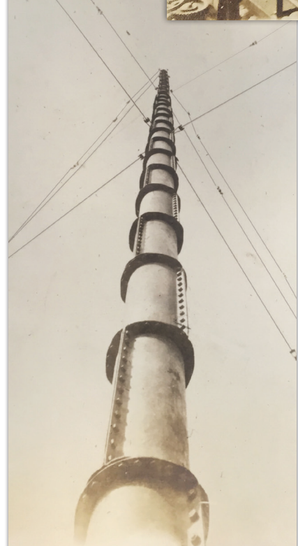
Looking up a wireless mast at the Marconi Wireless Telegraphy Station circa 1910.