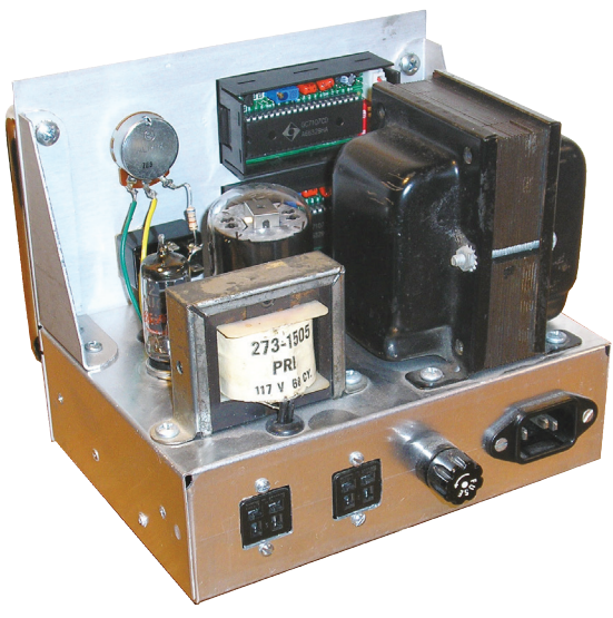
Figure 4 — The supply with the cover off, viewed from the rear.

For many tube circuits a B+ of 160V is too high, so I built a second supply, similar to the first one but using a lower voltage power transformer. A 6BF11 Compactron