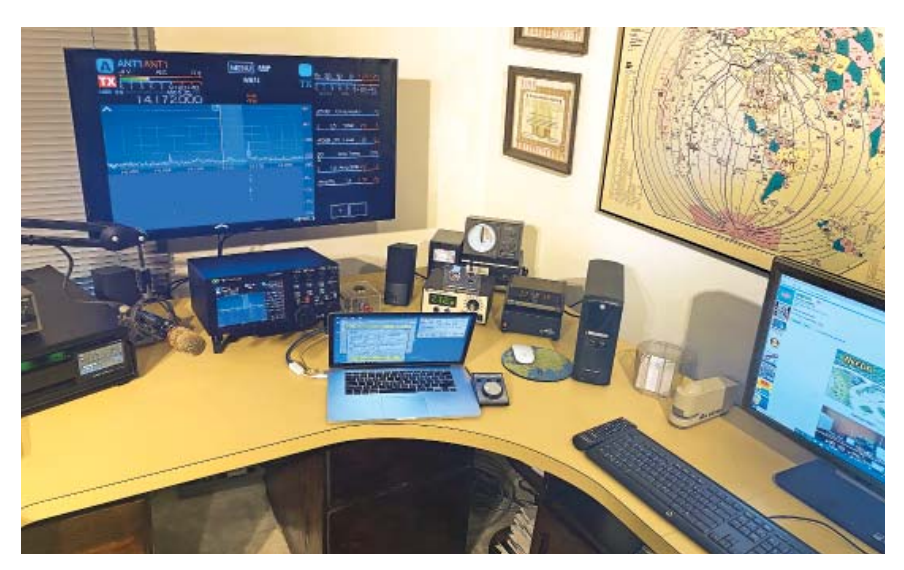
My base station is set up at my home in Connecticut.

closes the circuit on the 220 V line. The ability to switch equipment on and off will help protect it against power surges. Also, cycling it on and off periodically (such as with your modems and routers) can be beneficial.