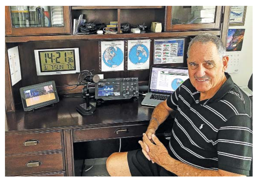
My remote station is in southern Florida, where I operate using a FlexRadio Maestro or a computer.

No matter what the distance is from your base station, remote operation is vulnerable to bad weather, particularly lightning. I'm not aware of a product that can protect your equipment as well as disconnect power. However, one approach is installing Poly-Phasers on the coaxial lines to prevent RF surges. This can be done outside by adding a ground for each PolyPhaser, or inside if there's a suitable