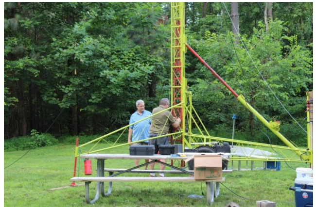
Figure 1 ARTS TOWER - Cranked up